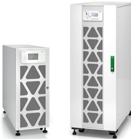
100 kVA Easy UPS 3M for external batteries

**Included with Easy UPS 3M; recommended service option for Easy UPS 3S