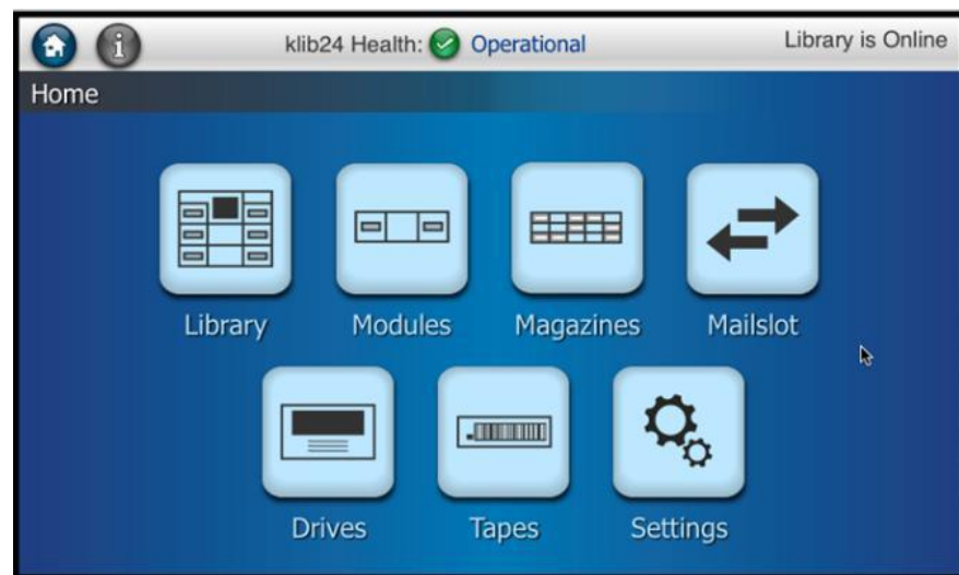
Figure 1. StorageTek SL150 Modular Tape Library Touchscreen Operator Panel

With the StorageTek SL150, simplicity begins with the library installation and continues throughout the life of the product, even as you expand for data growth. The library can be initialized in a few steps via the local touchscreen operator panel, and upgrades are easy because they require no tools, complicated cabling, or technical support.