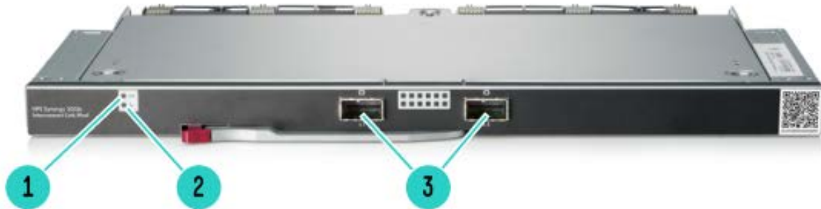
Figure 1 HPE Synergy 20G Interconnect Link Module Bezel

The master module contains intelligent networking capabilities that extend connectivity to frames equipped with satellite modules. This reduces top of rack switch need and substantially decreases cost. The reduction in components simplifies fabric management at scale while consuming fewer ports at the data center aggregation layer.