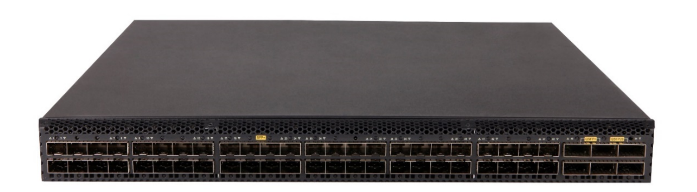
HPE FlexFabric 5710 48SFP+ 6QSFP+ or 2QSFP28 Switch (JL585A)

HPE FlexFabric 5710 Switch Series is ideally suited for deployment at the server access layer of large and medium-sized enterprise data centers. It delivers lower TCO while enhancing networking performance to support demanding virtualized applications and server-to-server traffic. Resilience and ease of management come hand-in-hand with the FlexFabric 5710.