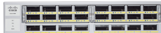
Figure 3. Cisco Catalyst 4900M Optimized for 10 Gigabit Ethernet Server (RJ-45) Connectivity