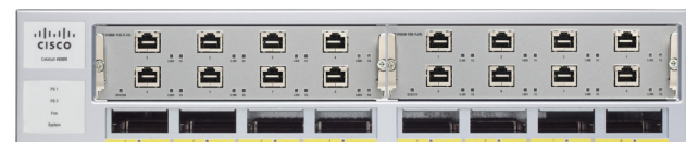
Figure 4. Cisco Catalyst 4900M Can Support 40 Ports of 10/100/1000 Ethernet at Wire Speed Without Oversubscription