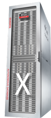
Oracle Exadata Database Machine X8M-2

The Oracle Exadata Database Machine is engineered to deliver dramatically better performance, cost effectiveness, and availability for Oracle databases. Exadata features a modern cloud-enabled architecture with scale-out high-performance database servers, scale-out intelligent storage servers with state-of-the-art PCI flash, leading-edge storage cache using persistent memory, and cloud scale RDMA over Converged Ethernet (RoCE) internal fabric that connects all servers and storage. Unique algorithms and protocols in Exadata implement database intelligence in storage, compute, and networking to deliver higher performance and capacity at lower costs than other platforms, for all types of modern database workloads including Online Transaction Processing (OLTP), Data Warehousing (DW), In-Memory Analytics, Internet of Things (IoT), as well as efficient consolidation of mixed workloads. Simple and fast to implement, the Exadata Database Machine powers and protects your most important databases. Exadata can be purchased and deployed on premises as the ideal foundation for a private database cloud, or it can be acquired using a subscription model and deployed in the Oracle Public Cloud or Cloud at Customer with all infrastructure management performed by Oracle.