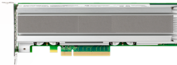
Figure 3. Flash Accelerator PCIe Card

These are real-world end-to-end performance figures measured running SQL workloads with standard 8K database I/O sizes inside a single rack Exadata system, unlike storage vendor performance figures based on small I/O sizes and low-level I/O tools and are therefore many times higher than can be achieved from realistic SQL workloads. Exadata's performance on real database workloads is orders of magnitude faster than traditional storage array architectures, and is also much faster than current all-flash storage arrays, whose architecture bottlenecks flash throughput.