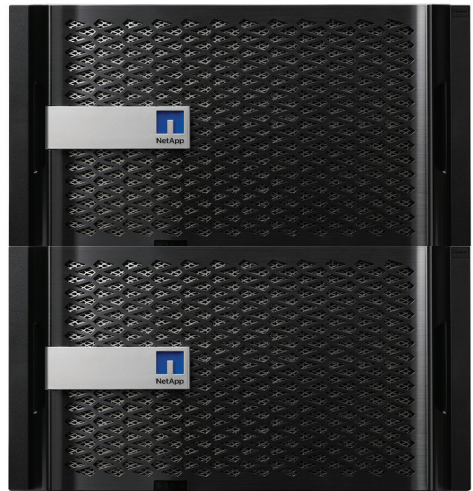
Figure 2) FAS8080 EX controllers.

Data Protection technologies protect your data, accelerate recovery, and integrate with leading backup applications for easier management.