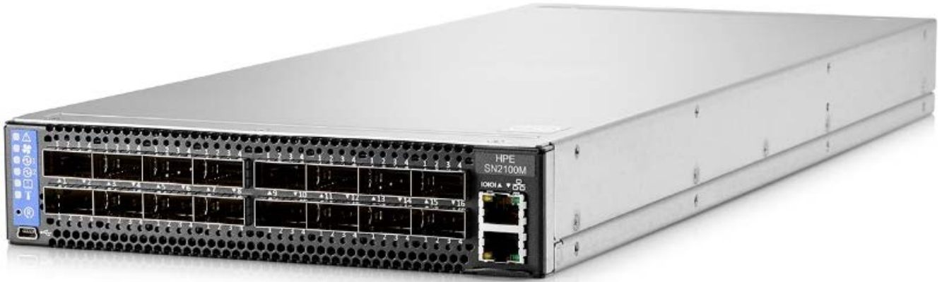
Figure 3: StoreFabric M-Series SN2100M (Side View)