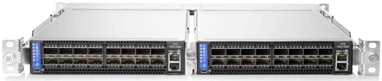
Figure 4: StoreFabric M-Series 2 x SN2100M (With Rack Installation Kit)