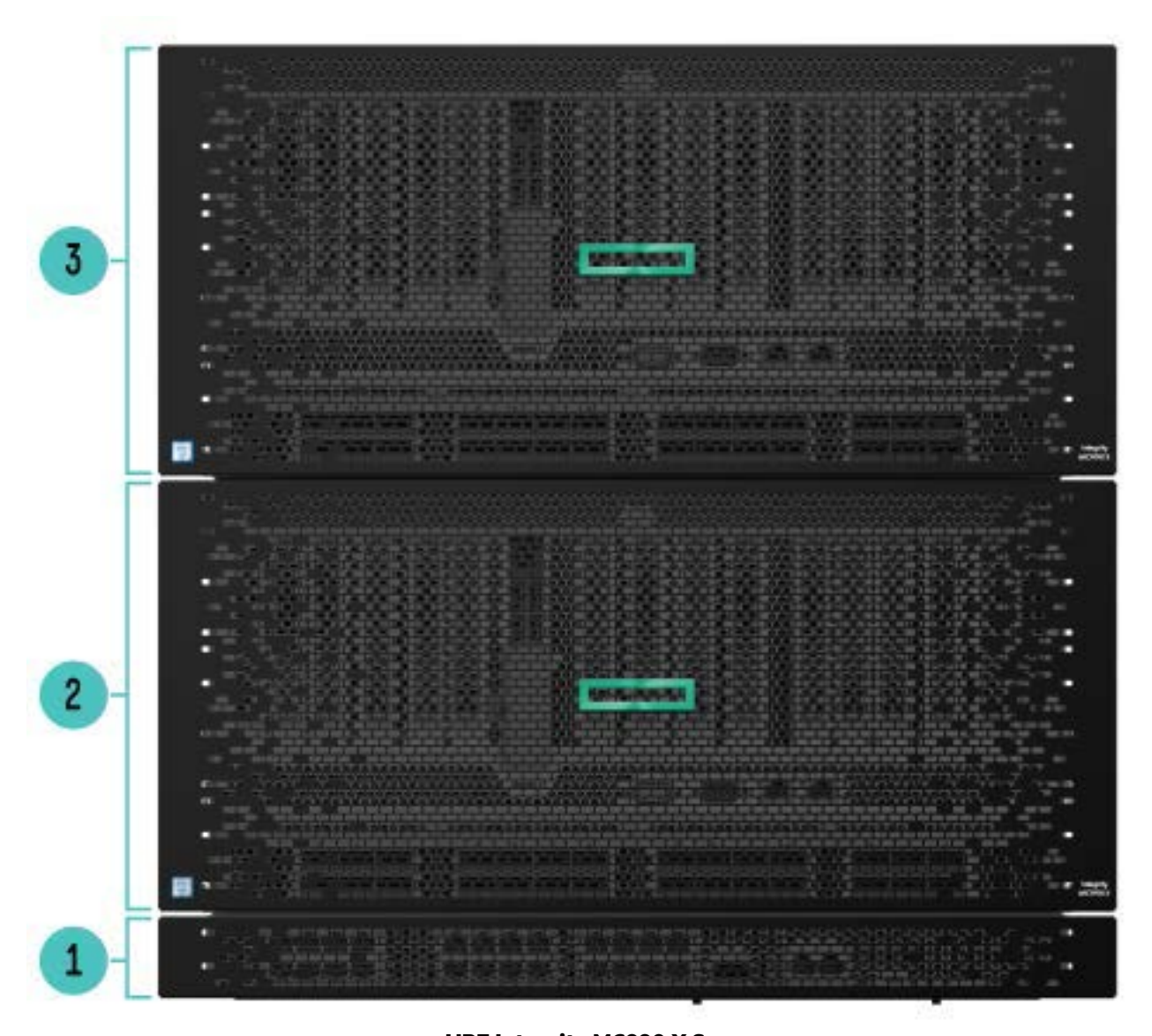
HPE Integrity MC990 X Server