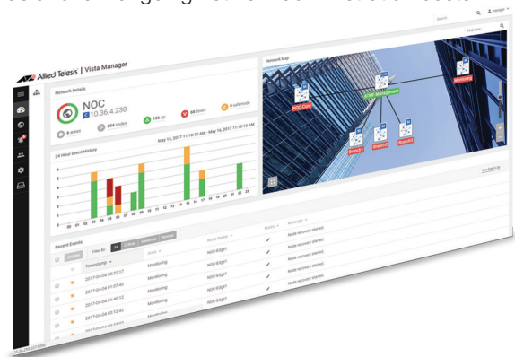
The overview dashboard provides at-a-glance status of network health with actionable reporting.