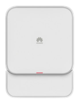
AP7060DN installed with an external IoT module