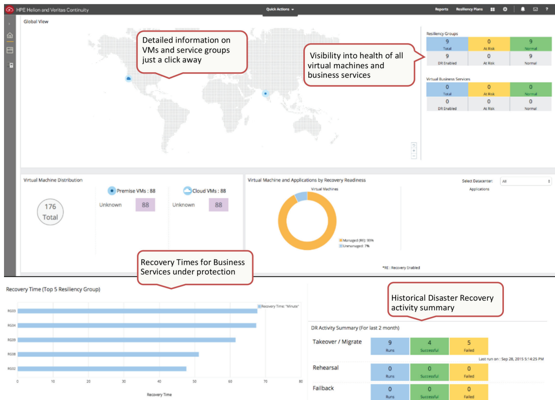
Figure 2. Web-based Dashboard showing a global view of IT service continuity health

Your business services and associated data are important and need to be protected. You may also require to adhere to various business continuity related industry standards and regulations to support correct operating procedures. Internal auditing teams require you to prove compliance on a regular basis via reports that can be shared with regulatory bodies. Be assured that HPE Helion and Veritas Continuity is based on HPE Helion