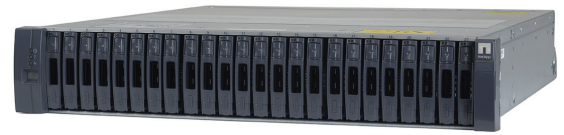
Figure 2) The DS2246 disk shelf—performance and storage density with 2.5" SFF drives.

Our family of disk shelves delivers the enterprise-class resiliency and availability that you expect while leveraging all of the storage efficiencies of the NetApp Data ONTAP® operating system. Plus, the same drives and shelves work across multiple system platforms with nondisruptive controller upgrades for the utmost in flexibility.