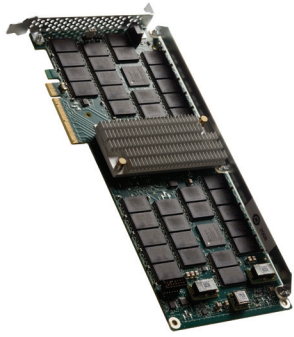
Figure 3) NetApp Flash Cache.