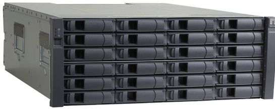
Figure 1) The DS4243 disk shelf—maximum capacity and performance.