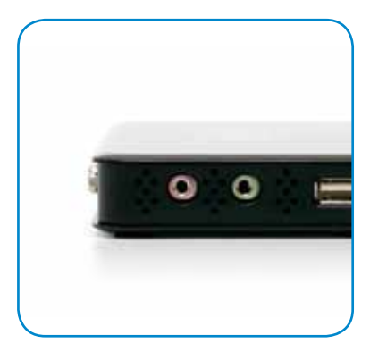
E01 Technical specifications