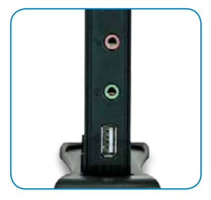
E02 Technical specifications