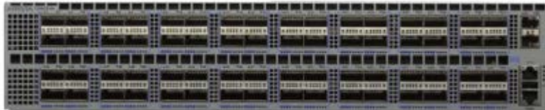
Arista 7260CX-64: 64x 100GbE QSFP100 ports, 2 SFP+ ports

Combined with Arista EOS both the 7060X and 7260X Series deliver advanced features for cloud, big data, virtualized, and traditional data centers.