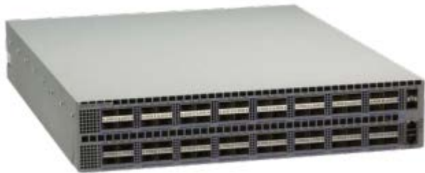
Arista 7260CX-64: 64x 100GbE QSFP100 ports, 2SFP+ ports

The 7060CX2-32S and 7060CX-32S deliver 32 QSFP100 ports in a 1RU system with an overall throughput of 6.4Tbps. All ports allow for a choice of 5 speeds including 100GbE, 40GbE, 4x10GbE, 4x25GbE or 2x 50GbE with a wide choice of QSFP transceivers and cables. All QSFP ports can operate in any mode without limitation enabling a wide choice of combinations for both top of rack and spine deployment. The Arista 7060CX-32S supports latency as low as 450ns in cut-through mode, and a 16 MB shared packet buffer pool that is allocated dynamically to ports that are congested. The Arista 7060CX2-32S introduces support for IEEE 25GbE and supports a larger shared packet buffer pool of 22 MB with the same low latency of 450ns.