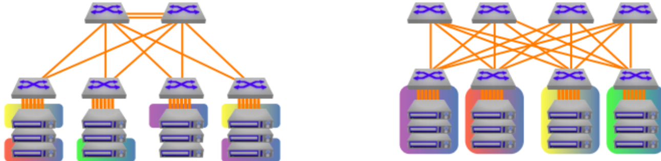
Arista Fixed System Leaf-Spine Designs Scale to 6,144 10GbE/25GbE ports or 1,536 40GbE/100GbE port at 3:1

The Arista 7060X and 7260X series deliver line rate switching at layer 2 and layer 3 to enable faster and simpler network designs for data centers that dramatically lowers the network capital and operational expenses. When used in conjunction with the Arista 7000 series of fixed and modular switches it allows networks to scale to over 27,000 10G/25G servers in low-latency two-tier networks that provide predictable and consistent application performance. The flexibility of the L2 and L3 multi-path design options combined with support for open standards provides architectural flexibility, scalability and network wide virtualization. Arista EOS advanced features provide control and visibility with single point of management.