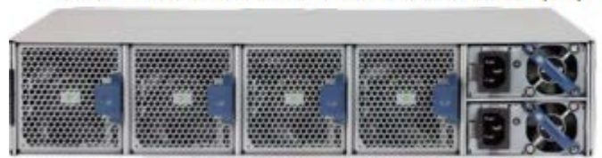
Arista 7260X 2RU Rear View: Rear to Front airflow (blue)