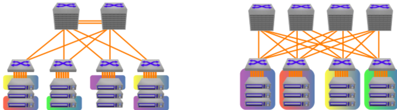
Arista Modular System Leaf-Spine Designs Scale to 9,216 40GbE/100GbE ports or 27,648 10GbE/25GbE ports at 3:1 subscription