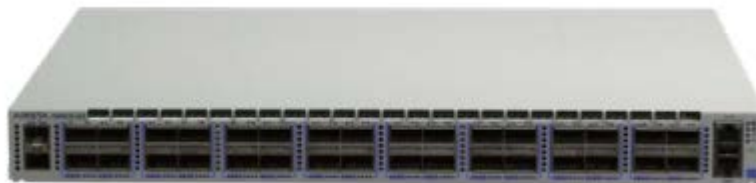
Arista 7060CX-32S: 32 x 40/100GbE QSFP100 ports, 2 SFP+ ports