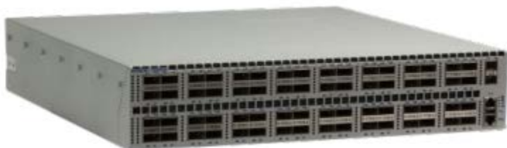
Arista 7260QX-64: 64 x 40GbE QSFP+ ports, 2SFP+ ports

The 7260QX-64 is a 2RU system with 64 fixed ports of 40GbE QSFP+ in a power efficient system with overall throughput of 5.12Tbps and up to 3.3Bpps of forwarding at both layer 2 and layer 3.