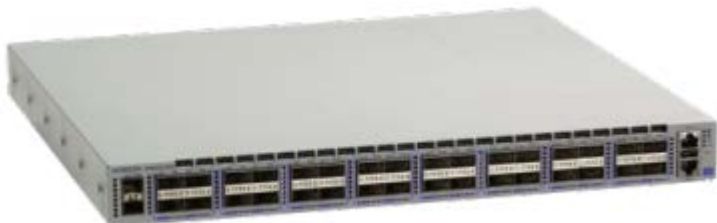
Arista 7060CX2-32S and 7060CX-32S: 32 x 100GbE QSFP100 ports, 2SFP+ ports

The 7060CX2-32S and 7060CX-32S deliver 32 QSFP100 ports in a 1RU system with an overall throughput of 6.4Tbps. All ports allow for a choice of 5 speeds including 100GbE, 40GbE, 4x10GbE, 4x25GbE or 2x 50GbE with a wide choice of QSFP transceivers and cables. All QSFP ports can operate in any mode without limitation enabling a wide choice of combinations for both top of rack and spine deployment. The Arista 7060CX-32S supports latency as low as 450ns in cut-through mode, and a 16 MB shared packet buffer pool that is allocated dynamically to ports that are congested. The Arista 7060CX2-32S introduces support for IEEE 25GbE and supports a larger shared packet buffer pool of 22 MB with the same low latency of 450ns.